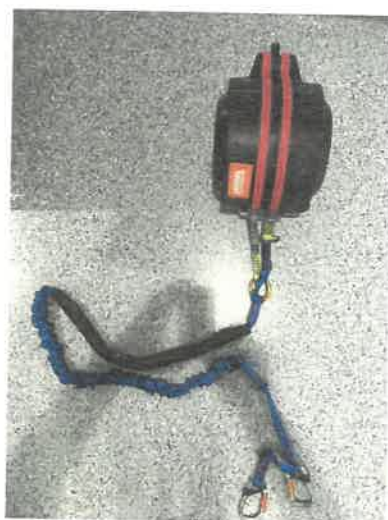
QUICKFLIGHT QF150-12A with 1 m RC