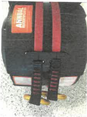
Quickflight QF150-12A without Ripcord (from all sides)